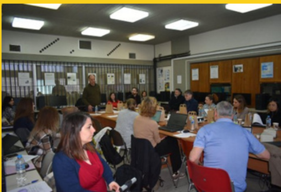
Project partners in Athens Meeting

The face-to-face Exten(DT)2 project meeting took place from March 29 to 31 2023 in Athens, Greece. This meeting lasted three full days and was held in the School of Philosophy Building at the University Campus of the National and Kapodistrian University of Athens. Project members from Sweden, Greece, UK, Norway, Ireland and Belgium attended the meeting, discussed the progress of the project and developed strategies and plans to take this further.