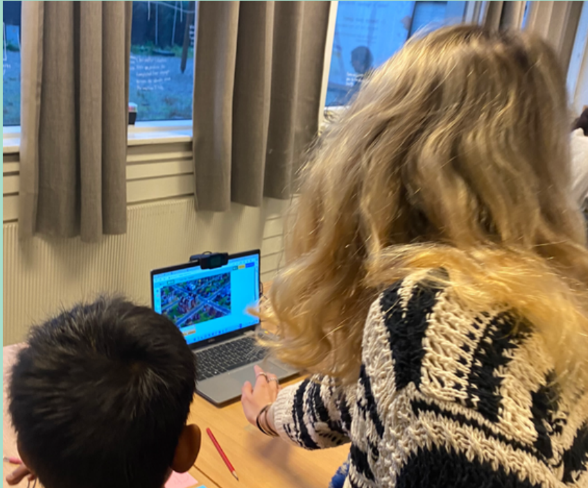
NTNU Team member assisting participant to use project technology in Norway

The NTNU team visited an International school in Norway in October to disseminate project activities to teaching and administrative staff and run a design thinking activity with some students and teachers using ChoiCo. Teachers at the school, during two days, had the opportunity to use the Exten(DT) 2 technologies, navigate the project’s website and get connected with project members to learn more about the project’s activities. Importantly, researchers and teachers had the opportunity to exchange ideas and thoughts on design thinking, the use of technologies in the classroom, discuss challenges and identify ways of support.