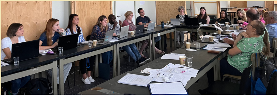
Exten(DT) 2 team members in Ghent, Belgium

The third face-to-face project meeting was held in Ghent between 27 and 29 September 2023. Team members from Sweden, Greece, the UK, Belgium, Norway and Ireland reflected on the pilot year of the project and discussed strategies to cope with emerging challenges that they may face while implementing design thinking (DT) projects in the second year of the project. They also discussed the extended versions of project technologies including MaLT2, SorBET, ChoiCo, nQuire for students, which have been modified following teacher and student feedback.